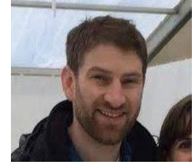
Sean Dellany Governor with responsibility for SEND